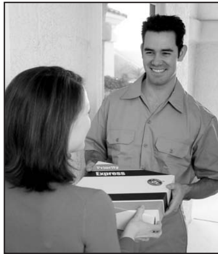
Total convenience! Your lessons, equipment...everything is delivered right to your doorstep. What could be easier?

Computers have revolutionized the pharmacy industry. Discover computer programs that help control inventory and expedite customer service.